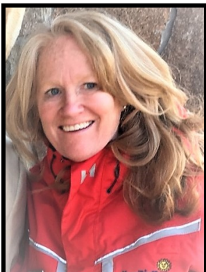
Top of the Course!